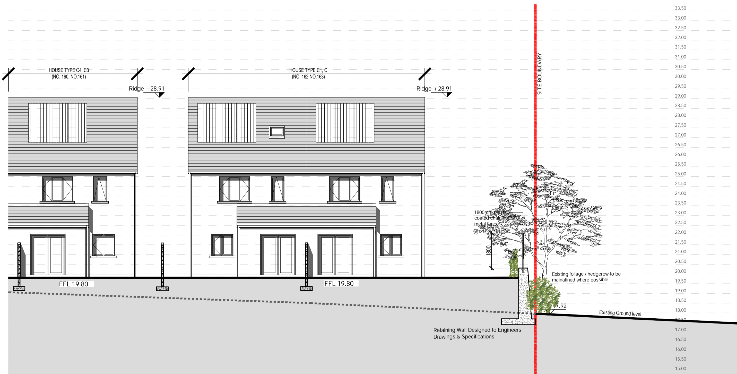
02 Site Section J-J Scale: 1:100