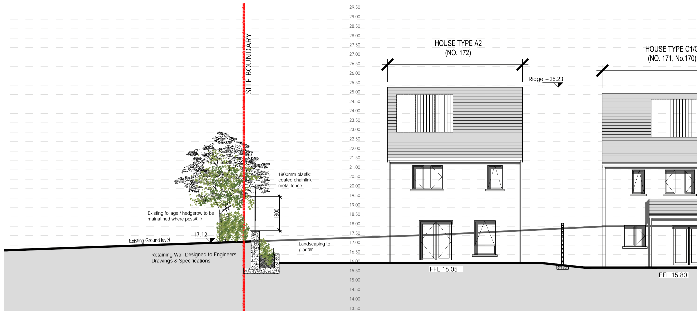
01 Site Section H-H Scale: 1:100